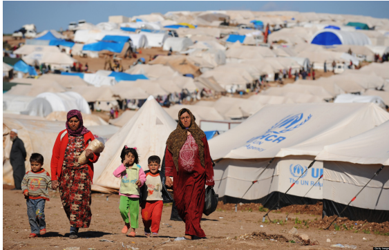
Refugees at UNHCR camp, Jordan.

"The Refugee issue" is a reality we must face today. My grandmother and her family became refugees in a tented camp when I was in my early teens and our family life filled up with emotions of stress and grief. The fear for loved ones, and loss of a family home filled with precious memories, left me resolved to do something for refugees and homeless. Because when one person becomes a refugee it affects others, like a ripple in a pond. In our family, losing home abroad made us unable to pay for our home in London; we were no longer secure in it and we became "sitting tenants" (illegally inhabiting our own home). All the family members came to live in our home, with not enough money or space. Stressed by knowing that I could never afford to live in the beloved family home, and unable to imagine how I would ever afford to buy one, but filled with ideals of making cities and building poetic homes from earth, I travelled afar seeking how to build a home in the world. I was looking for a sense of belonging and trying to shake the feeling of insecurity about Home. I was also striving to overcome the prejudices dividing peoples and looking for real community, where the purity of Being was built into the relationships.