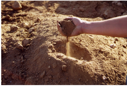
Putting your hand in the earth