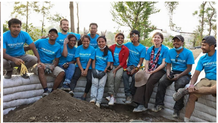
Therapeutic building with others after Nepal earthquake, May 2015