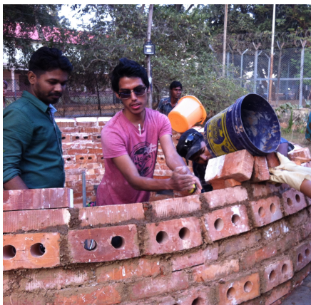
Below: The alchemical process of building and firing a ceramic dome together.