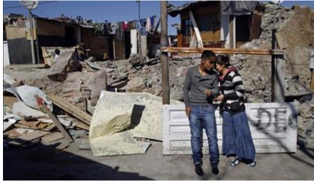
El Galinero shanty town near Madrid, Spain.

How can refugees build their homes in the world, when so much is opposing in their life? Grief for the lost family members and homes, depression and confusion for changed reference points, a lost city and way of life, combines with the passion of blaming others. How can the host country welcome the refugees and find the positive side of the situation? It is not enough to give a refugee a tent and then a prefabricated home. This will not instantly make the inhabitants feel at home in the world. Every person, and most especially the refugee needs to experience a grounding, and healing journey whose destination is being at home in their own body.