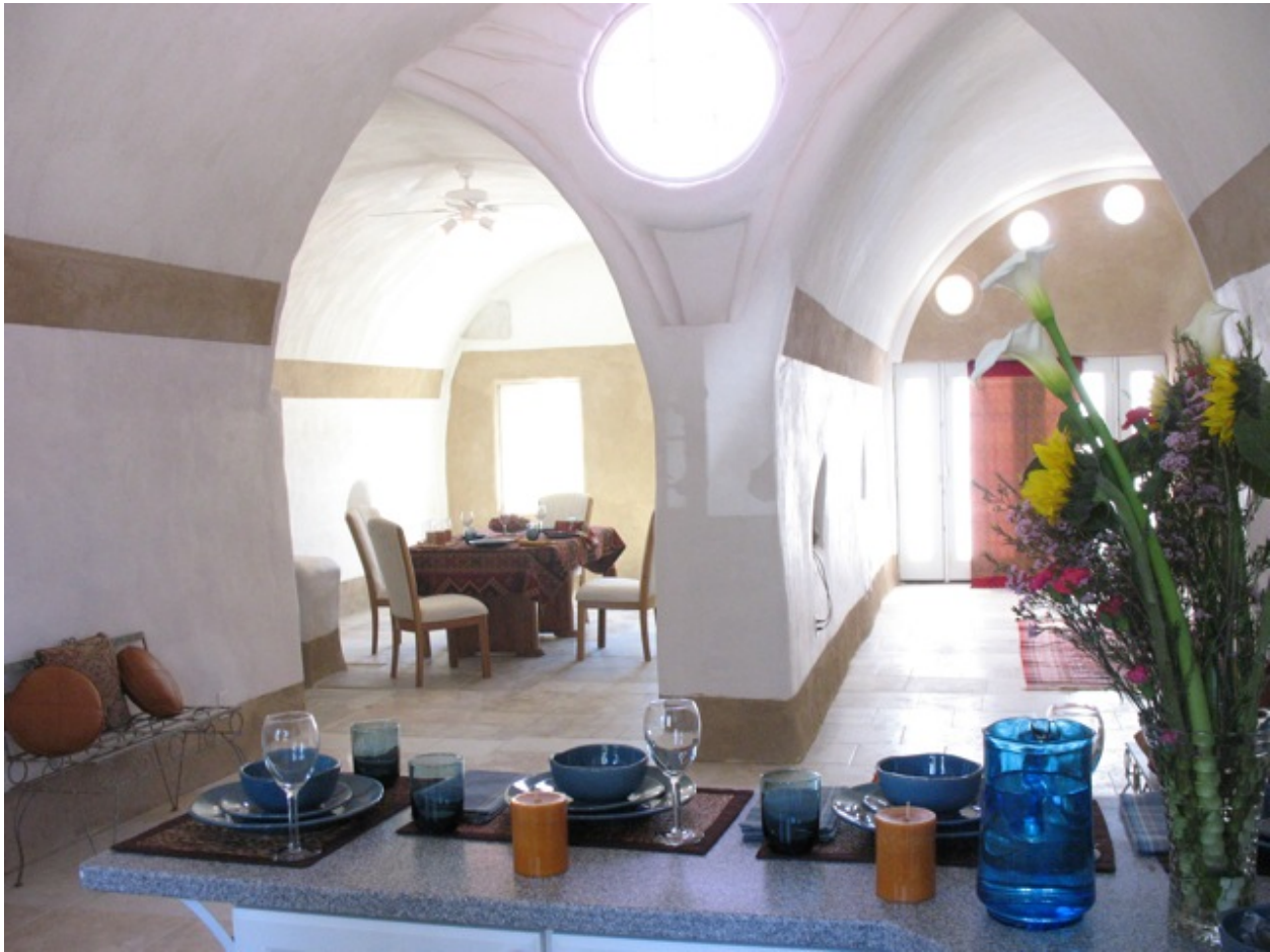
Earth One. Vaulted Home at Cal-Earth Institute. California. built by students and members of the public.