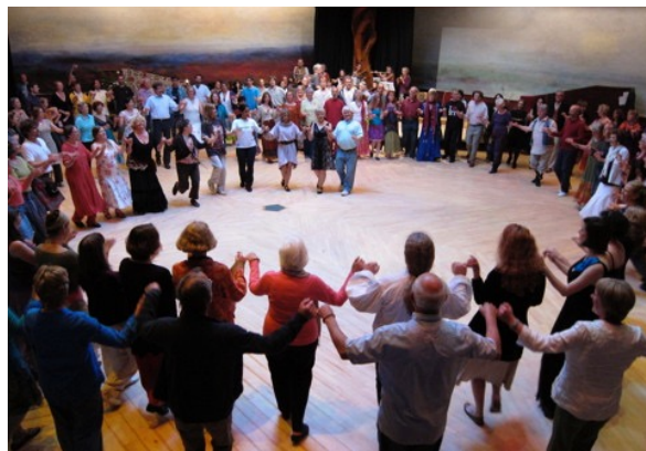
Above: Community dance: vibration, breath, word

Ultimately, What is this “Putting our Hands in the Earth?” It is coming to a sense of physical reality, truth and the healthy connection of body, heart, and mind. In this sense “earth” is all of the universal elements, and all of the universal “elements” within the design of the human being. Earth is also love, it is healing, and in the end there is only one element. Thus earth turns to gold in the hands of the wise. The hands-on workshop at Domoterra offers to institutions, NGOs, students and professionals innovative new interpretations of ancient traditions. Building your own home, as I found out over the years of practice, is a healing journey from feeling homeless to feeling at home in the world. Though this is an inner journey, along the way there must be a useful product, a tangible home. Building with a group also becomes a shared journey to create a community, a city, one in which the inhabitants feel ownership and create meaning. Thus the architects’ job includes not only AutoCAD, geometry and materials, it includes inspiration, love, skill, and also money, people, co-operation, contracts. Architects’ work should embrace the role of Master Mason, in Project Management contracts. It is a holistic design work. This workshop will take the next steps in new formulas to include the inhabitants in the process of building their city, and to turn the Earth into Gold.